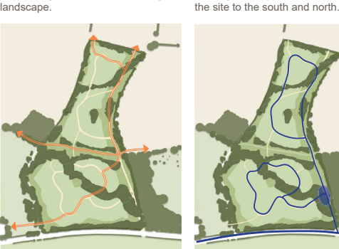
4. New footpath network connects to the wider countryside and provides access around the burial space.