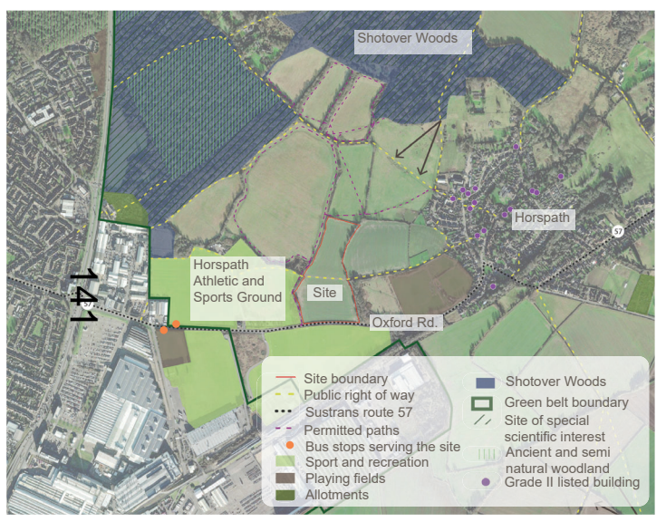
Site location and context